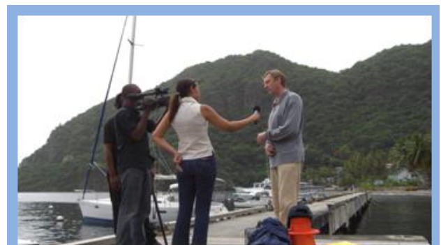
Envision staff being interviewed for St Lucian television as part of a public awareness campaign for the coastal habitat project.